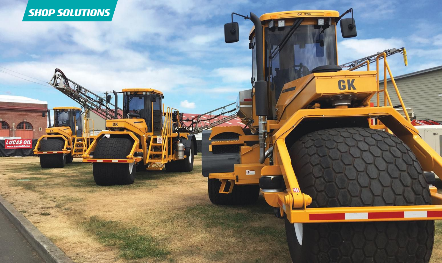
The GK 3W6 Sprayer was featured at the Oregon State Fair. It has been updated with a more fuel-efficient engine and 200 percent stronger frame.