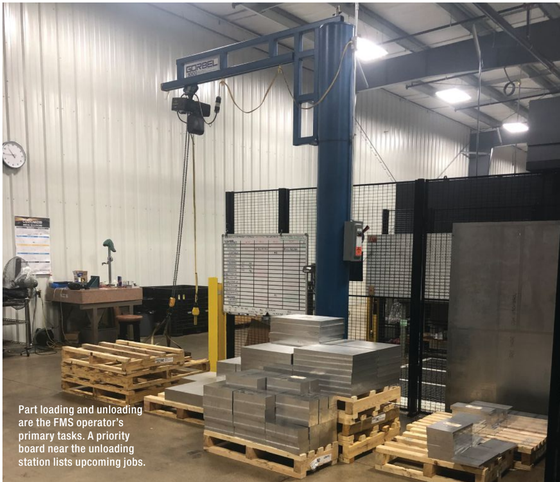
Part loading and unloading are the FMS operator's primary tasks. A priority board near the unloading station lists upcoming jobs.

tombstone fixturing and purchasing tooling to enable that first HMC to start production. The shop ran it as a standalone unit until the FMS